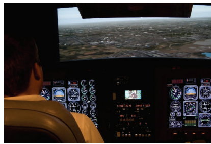
Training in the Simulator