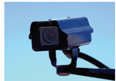
Meacham Ops 24/7 - 817-994-0653

The security system will be monitored 24 hours a day, 7 days a week by Airport Operations. In addition to the 24/7 Operations staff and an on-site City of Fort Worth Police Department location, this system will assist us in the deterrence of unauthorized AOA entry, theft and vandalism. As we continue forward with this security system we would love to hear any ideas or input from the tenants on how we can improve the security of the City Airports, and remember to contact Airport Operations if you observe suspicious activity.